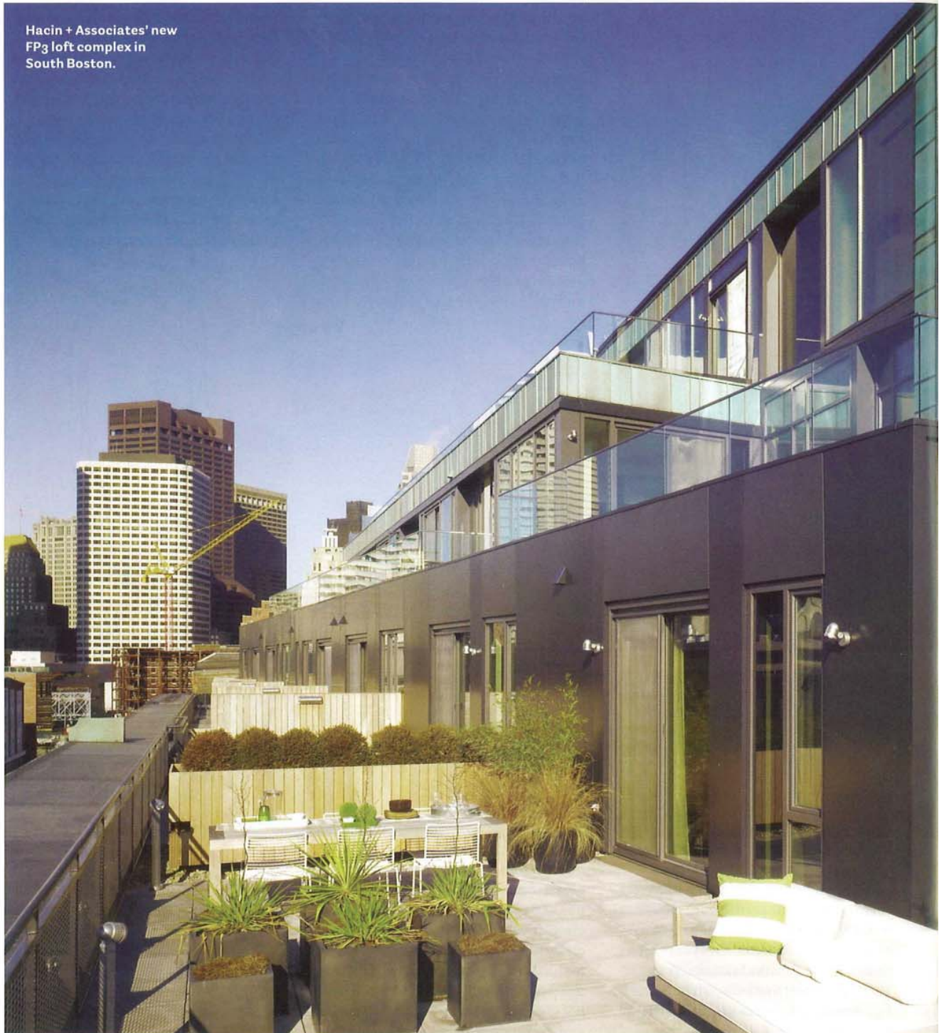
Hacin + Associates' new FP3 loft complex in South Boston.