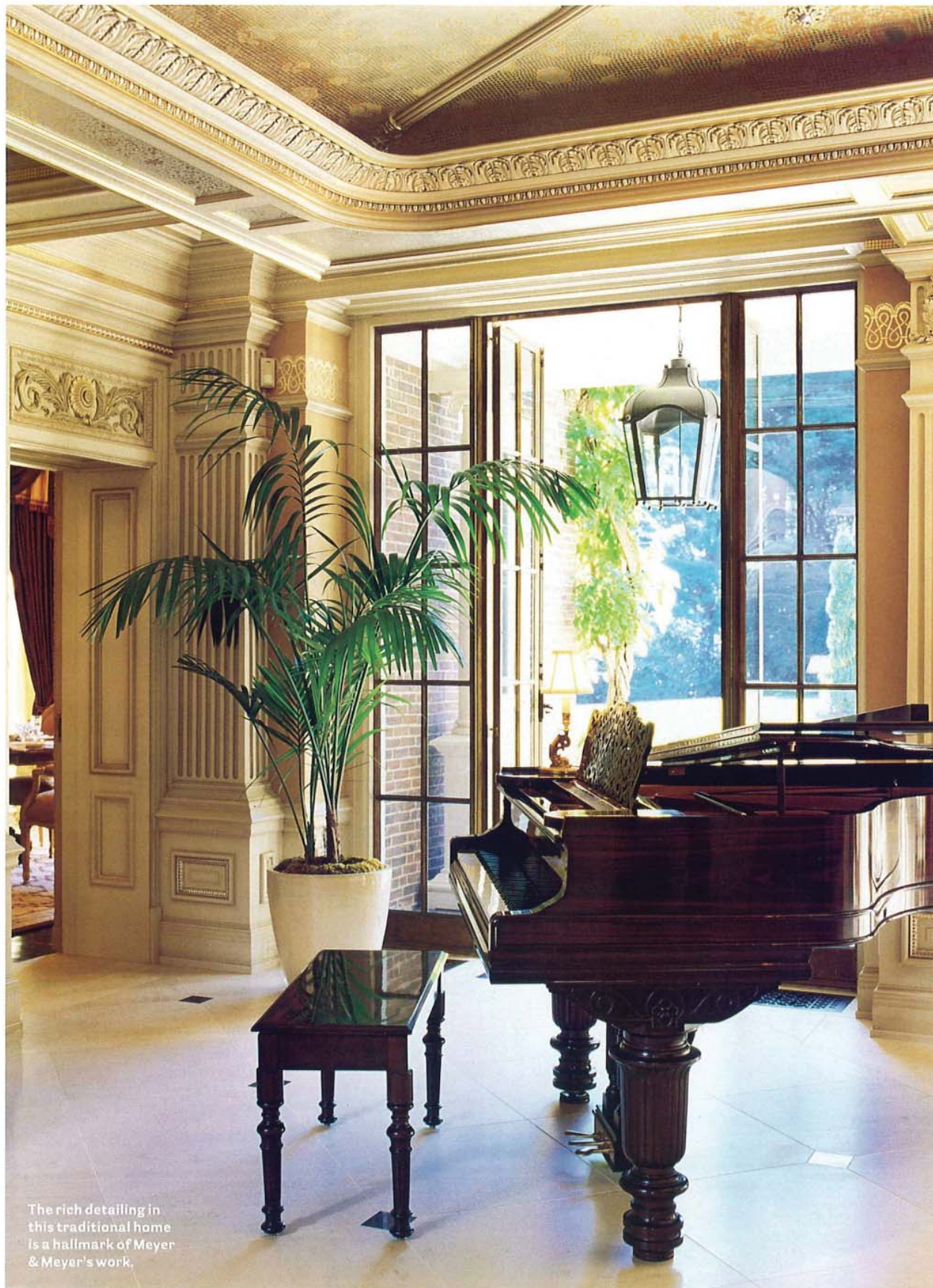
The rich detailing in this traditional home is a hallmark of Meyer & Meyer's work.