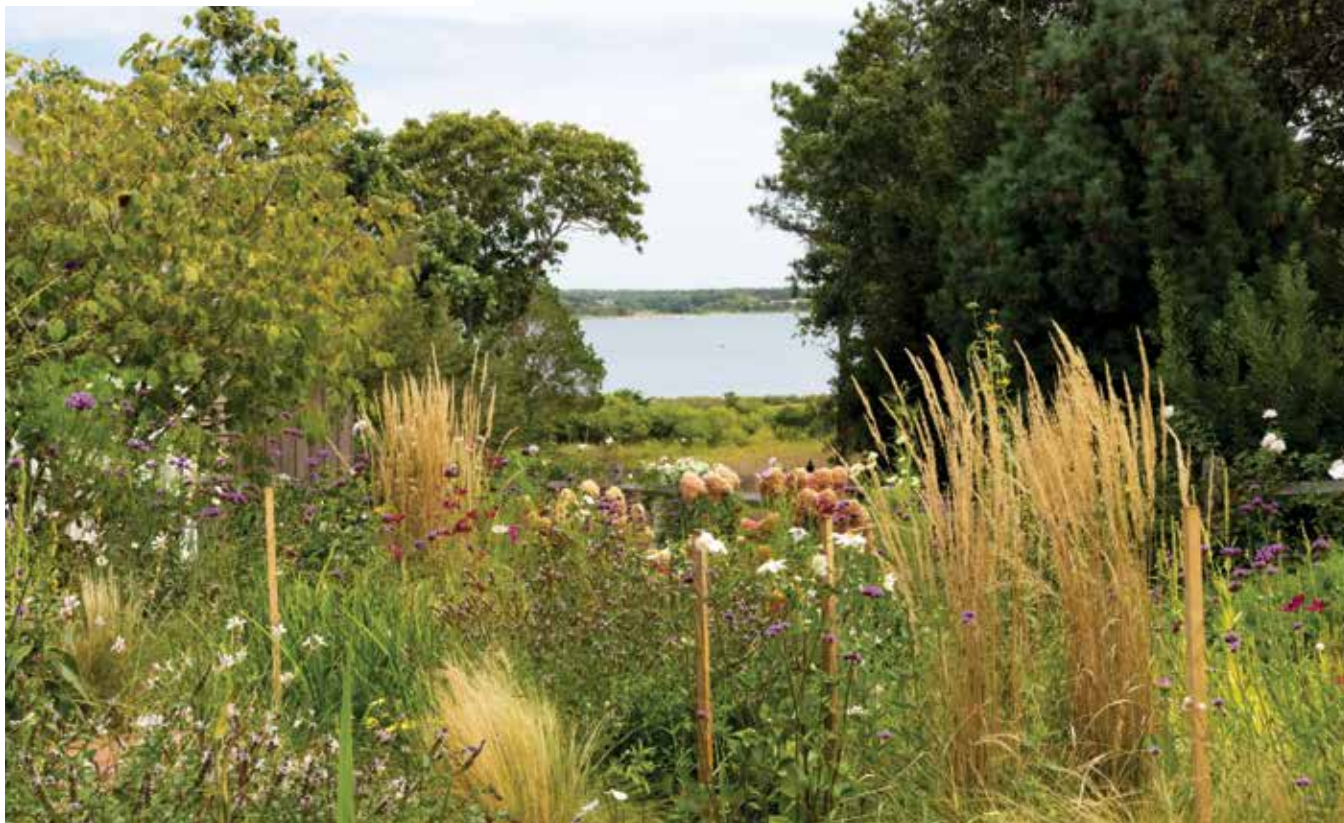
ABOVE: The gardens turn meadow-like further from the house to frame the water view with a smattering of perennials and hydrangeas that plays against the strong vertical lines of ornamental grasses. RIGHT: The periphery grasses are left purposefully unmown to add volume and nurture insects through late autumn when they turn a ravishing flaxen hue.

and open—invite everyone outside. A dramatic pool pavilion/outdoor kitchen showcases crisscrossing beams above billowing shrubs chosen for blossom and texture.